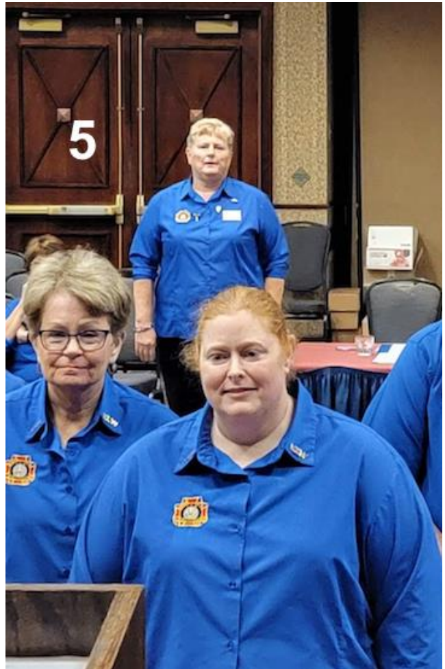
5) Installed as Sr. Vice, 6/20/21