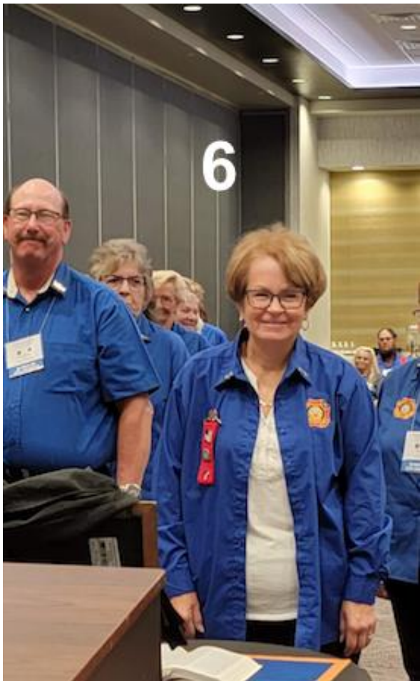
6) INSTALLED AS DEPARTMENT PRESIDENT 6/12/22