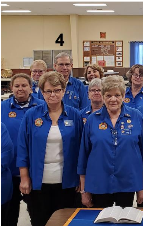
4) Installed as Jr. Vice, 6/20/20