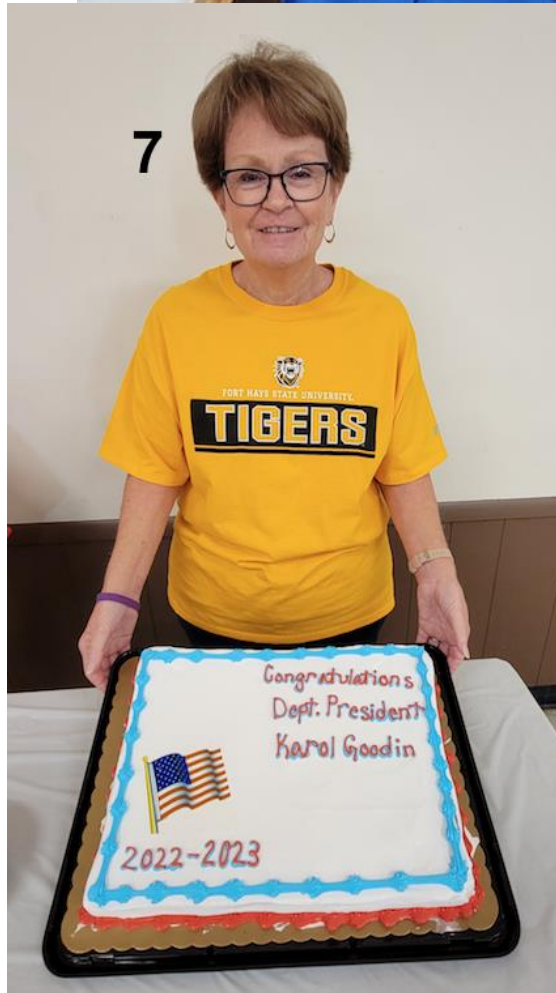
7) Commander and Presidents Reception 8/13/22